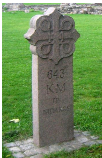
St. Olav's cross marker

The paths we are on are narrow and climb steeply up into the terrain and then into the forest. Can you see Fåberg just over that rise? Further north we approach the settings of Peer Gynt and Kristin Lavransdatter near Hunderfossen. In 1920, Sigrid Undset wrote a trilogy about Kristin Lavransdatter and life before the Black Plague. She writes that Kristin walked barefoot while carrying her baby son to St. Olav's tomb. We are walking in her footsteps!