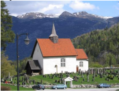
Seljord Kirke built in the 12 th century