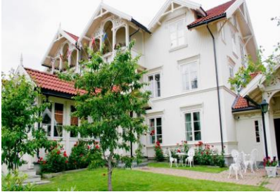
Seljord Hotel built in 1857