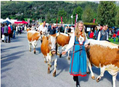
Leading the cows