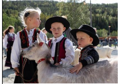
Children in bunads

Who has kaffe tørst? Yes, I think it is time we went for lunch and a cup of kaffe! The food court is massive, covering 1350 m 2 . There is food from all over Norway available in the building straight ahead.