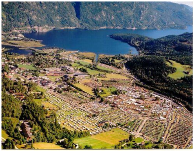
Seljordsvatne is in the upper part of the picture, with Dyrsku'n located in the bottom right.