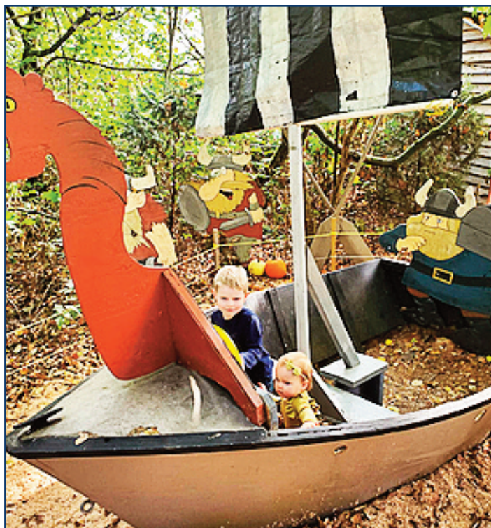
Connor & Penelope Schilbach of Varden Lodge found a pumpkin patch with a Viking ship!