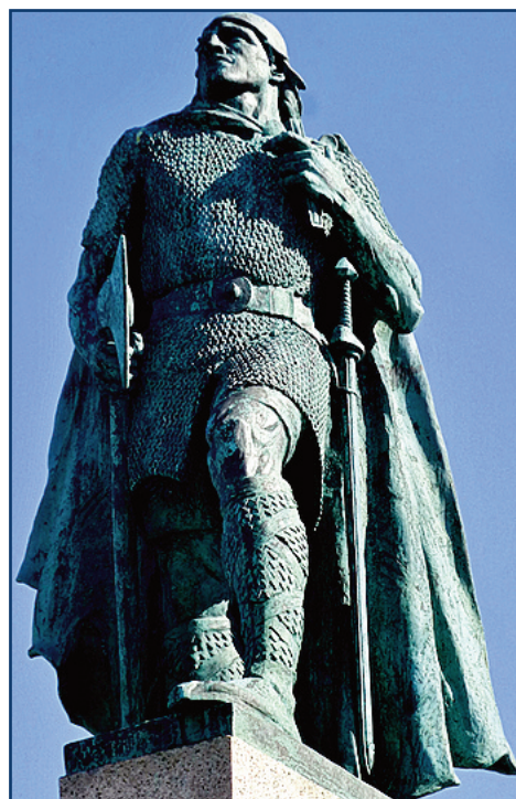
Leif Erikson is located near Hallgrimskirkja, a church in Reykjavik

Pictured is a photo I took while visiting Reykjavik. In our lodge, we have a program called "Getting to Know Norway". Members volunteer to speak of anything Norwegian. Our members are a good source of firsthand information about Norway. Learning