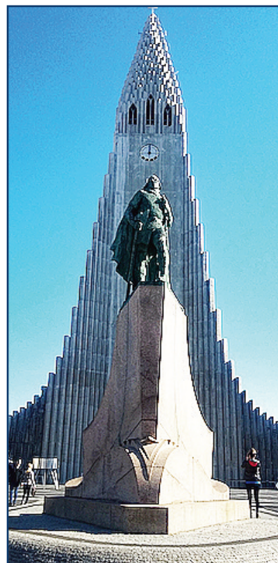
Hallgrimskirkja Church was started in 1945 after the war.