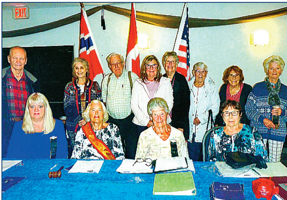
Rondane Lodge September 22 Lodge Meeting.